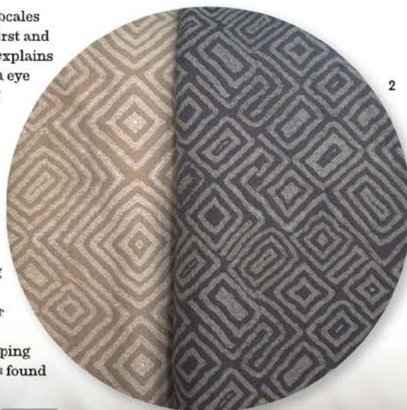
2. Lamu, a square-pattern motif, is available in Oyster and Pewter colorways.