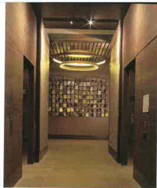
Top: Oak-veneered paneling lines an elevator vestibule off the lobby. Center: A custom wool rug softens the white-oak floor in the smaller party room. Bottom: In the larger party room, leather upholsters the sectional. Opposite: For the mail room, Clodagh and Fabio Designs collaborated on Wellness Word Search.

such as joy and solace, and an elevator vestibule share the main part of the lobby. Beyond are a pair of party rooms, a pair of residents-only lounges, either for socializing or for quiet contemplation, a temporary leasing office, a business center, and an Equinox gym “just tarted up a bit,” she notes. Two model apartments, a 700-square-foot one-bedroom and a 450-square-foot studio, were part of the brief as well. Well, more than two over time: Units are renting so fast that the