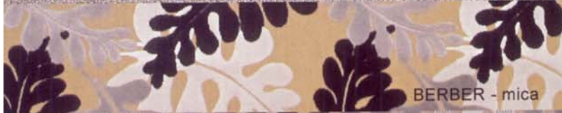
BERBER - mica