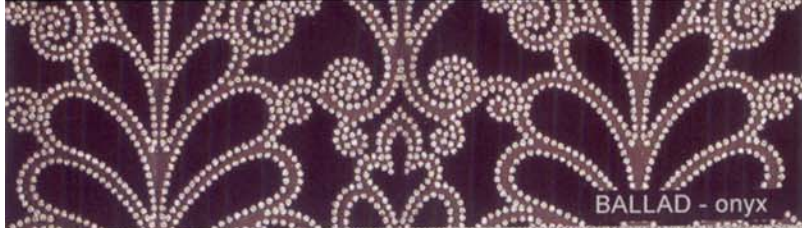
BALLAD - onyx