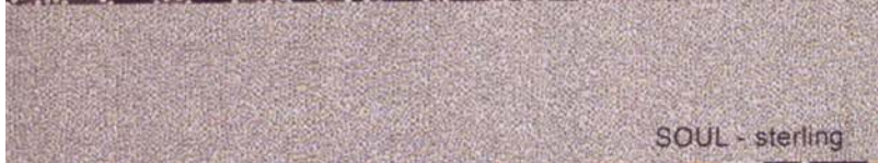
SOUL - sterling