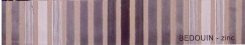
BEDOUIN - zinc