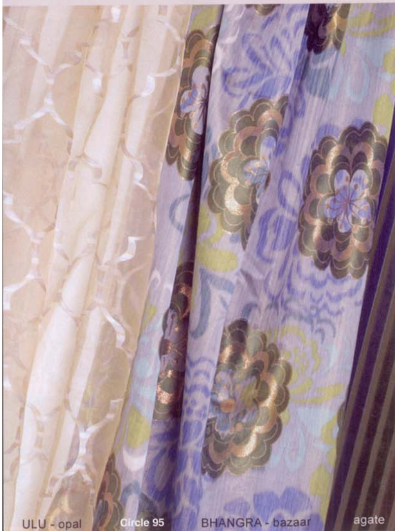
ULU - opal