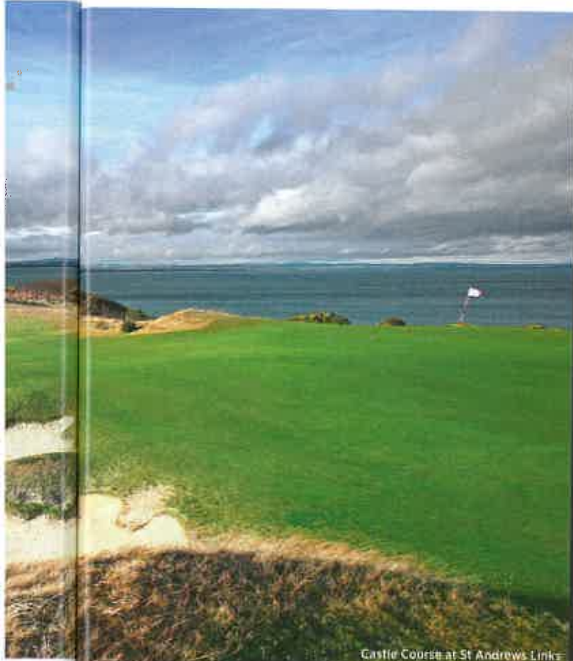
Castle Course at St Andrews Links