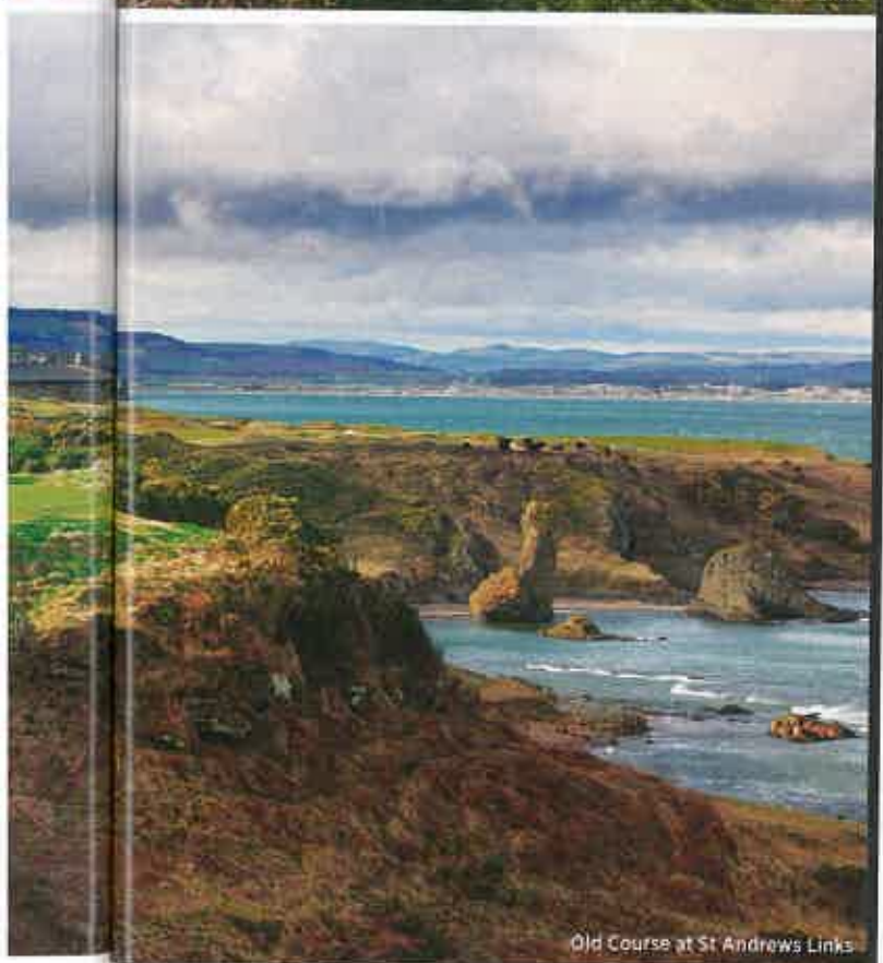
Old Course at St Andrews Links